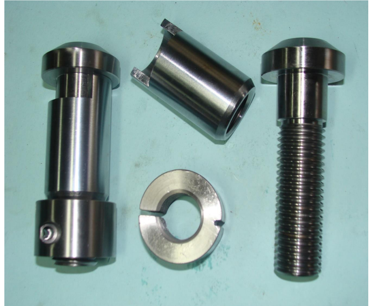
Sub – assembly for escalators