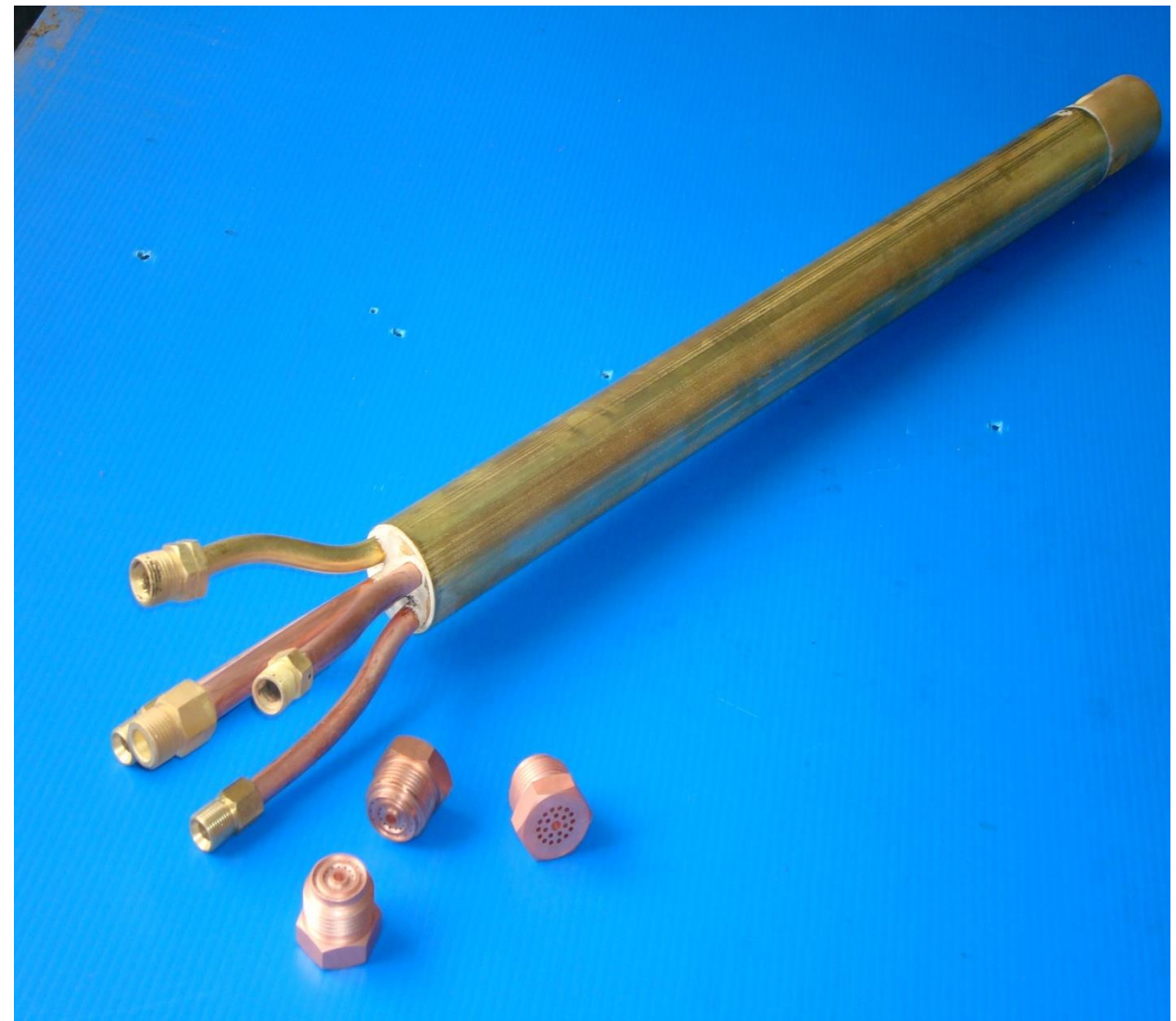
Gas Cutting Torch Assembly