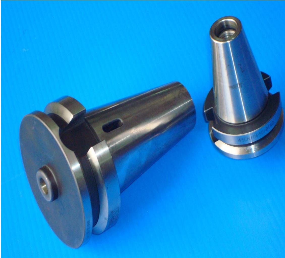
CNC Tool Holders