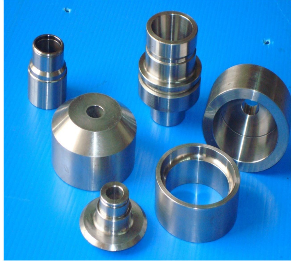
Stainless Steel Turned Parts