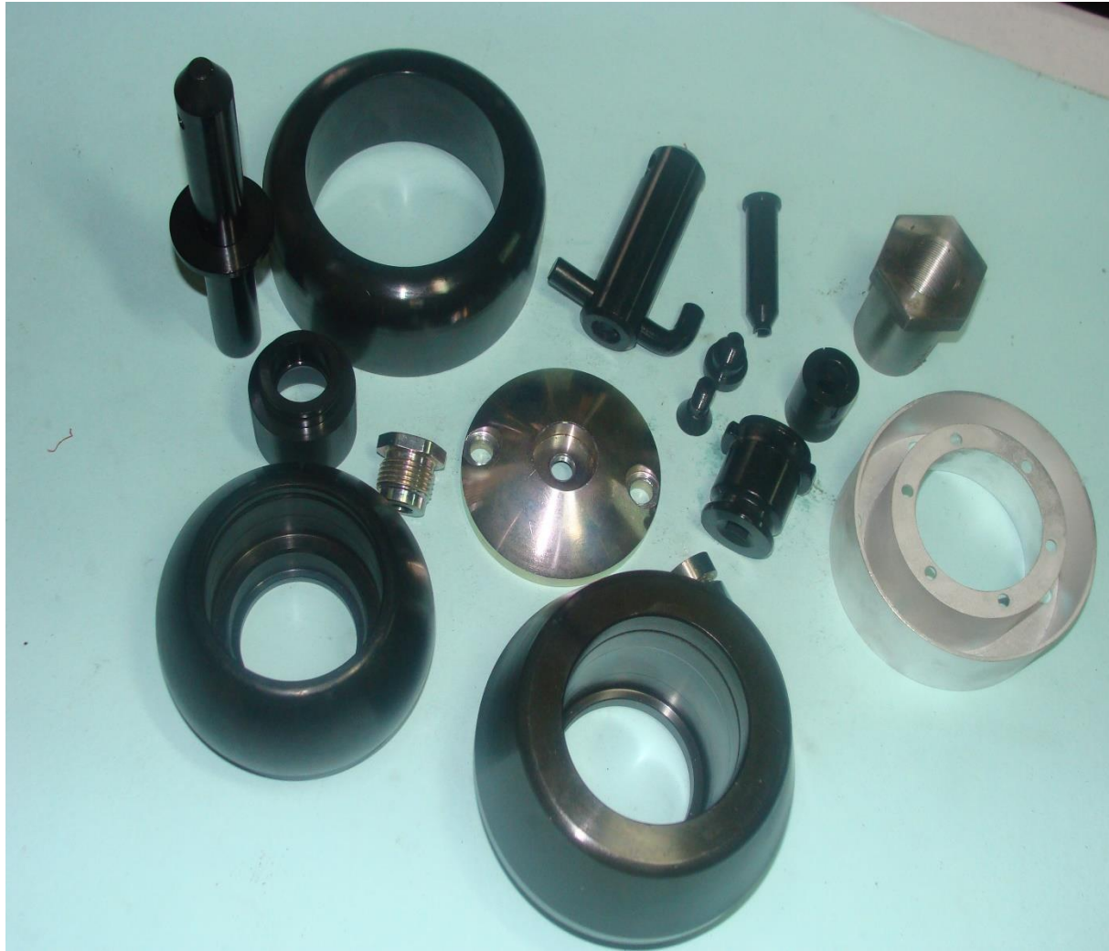
Steel Turned Parts