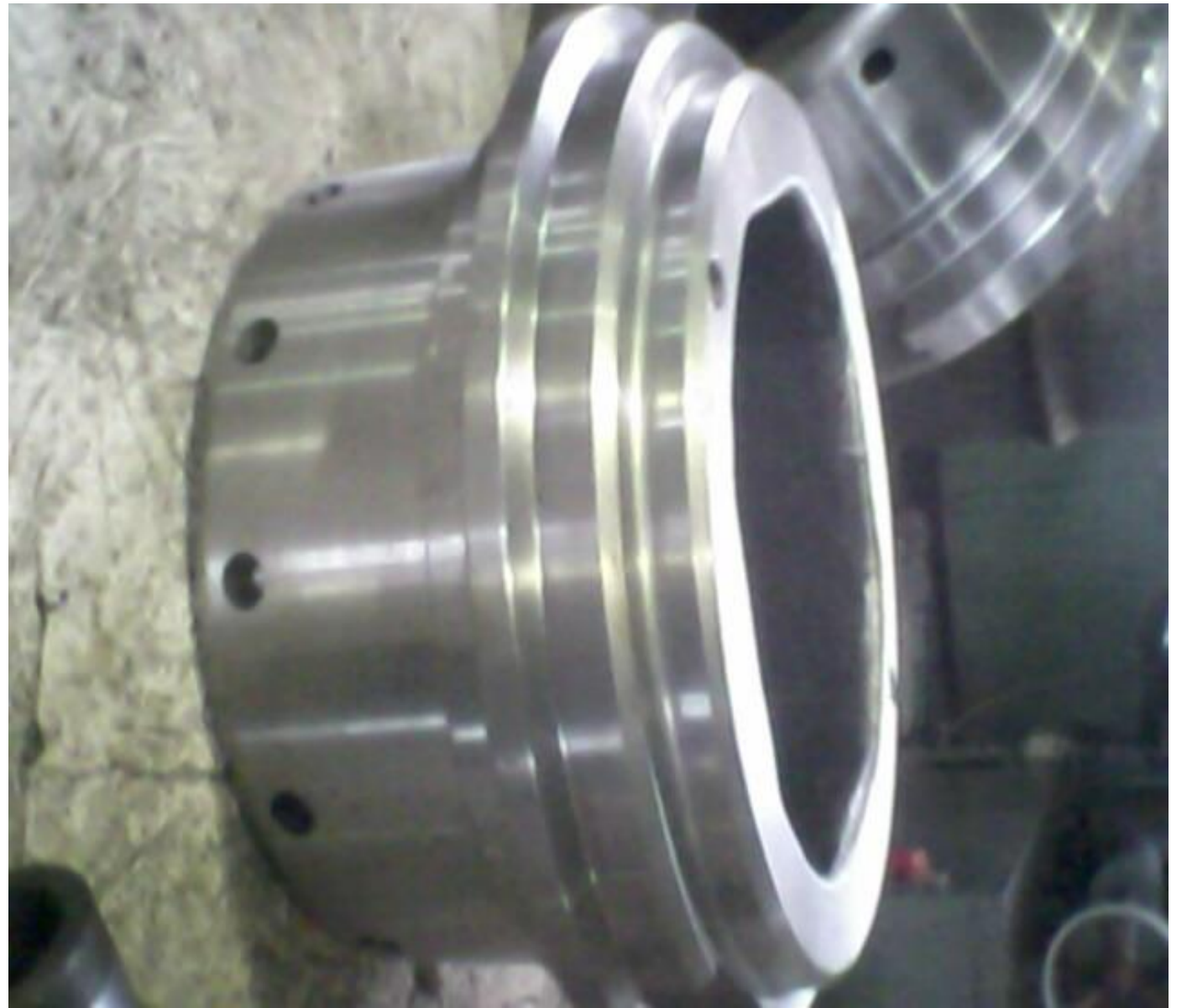
Machined Steel Casting