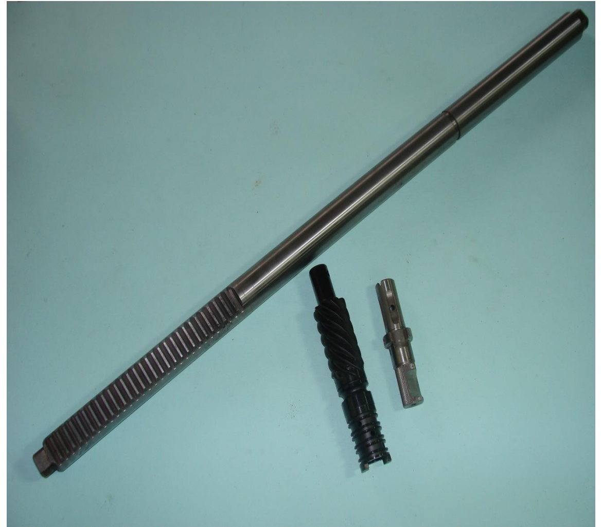
Rack & Pinion